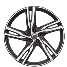
22" 5 Double Spoke (#175)