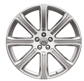
21" 8 Spoke (#174)