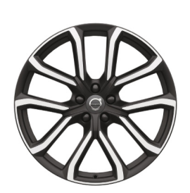
20" 5 Double Spoke (#234)