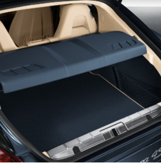
Fixed luggage compartment cover in leather, personalised luggage space mat with leather edging