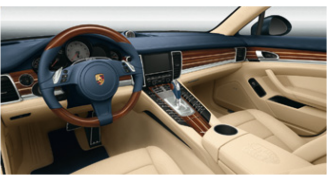
Yachting Mahogany interior package, heated multifunction steering wheel in Yachting Mahogany, gear selector in Yachting Mahogany