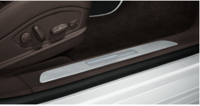
Seat console in leather, inner door sill trim in leather, personalised door sill guards in brushed aluminium, illuminated

Bi-Xenon main headlights in black including PDLS