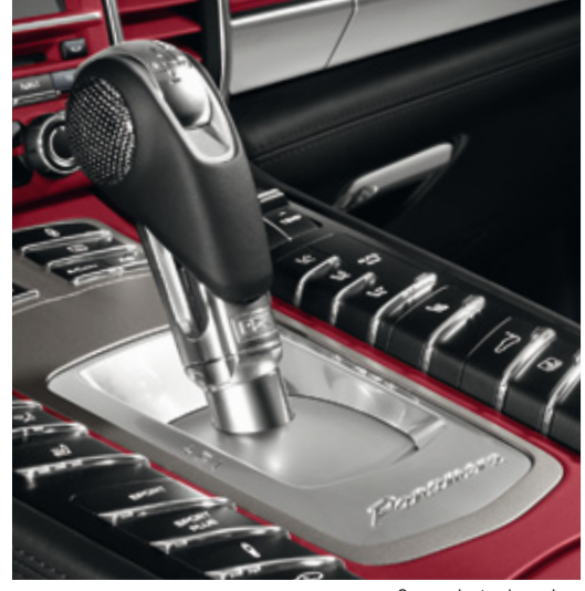
PDK gear selector in aluminium