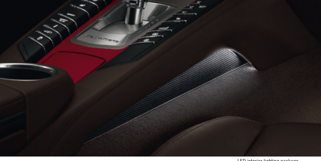
LED interior lighting package

not available o I number/extra-cost option • standard equipment A available at no extra cost More detailed information on individual equipment and equipment packages can be found in the current vehicle price list.