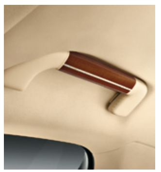
Rooflining grab handles in Yachting Mahogany

of maritime flair. Other highlights include a cooling compartment in the rear and Porsche Rear Seat Entertainment.