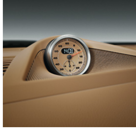
Sport Chrono stopwatch dial face in Luxor Beige

Porsche Crest embossed on front headrests, seat belts in Silver Grey