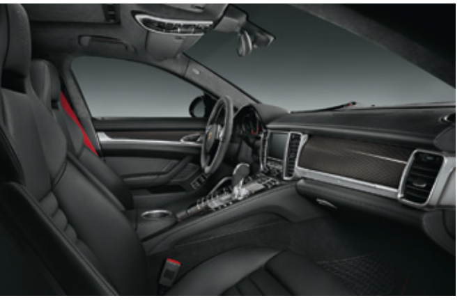
Dashboard trim package in leather, Sport Chrono stopwatch dial face in Guards Red, seat belts in Guards Red

desires brought to fruition. After all, it's often only in the small details where true style finds expression.