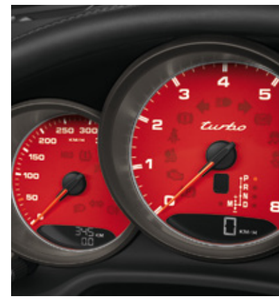
Instrument dials in Guards Red