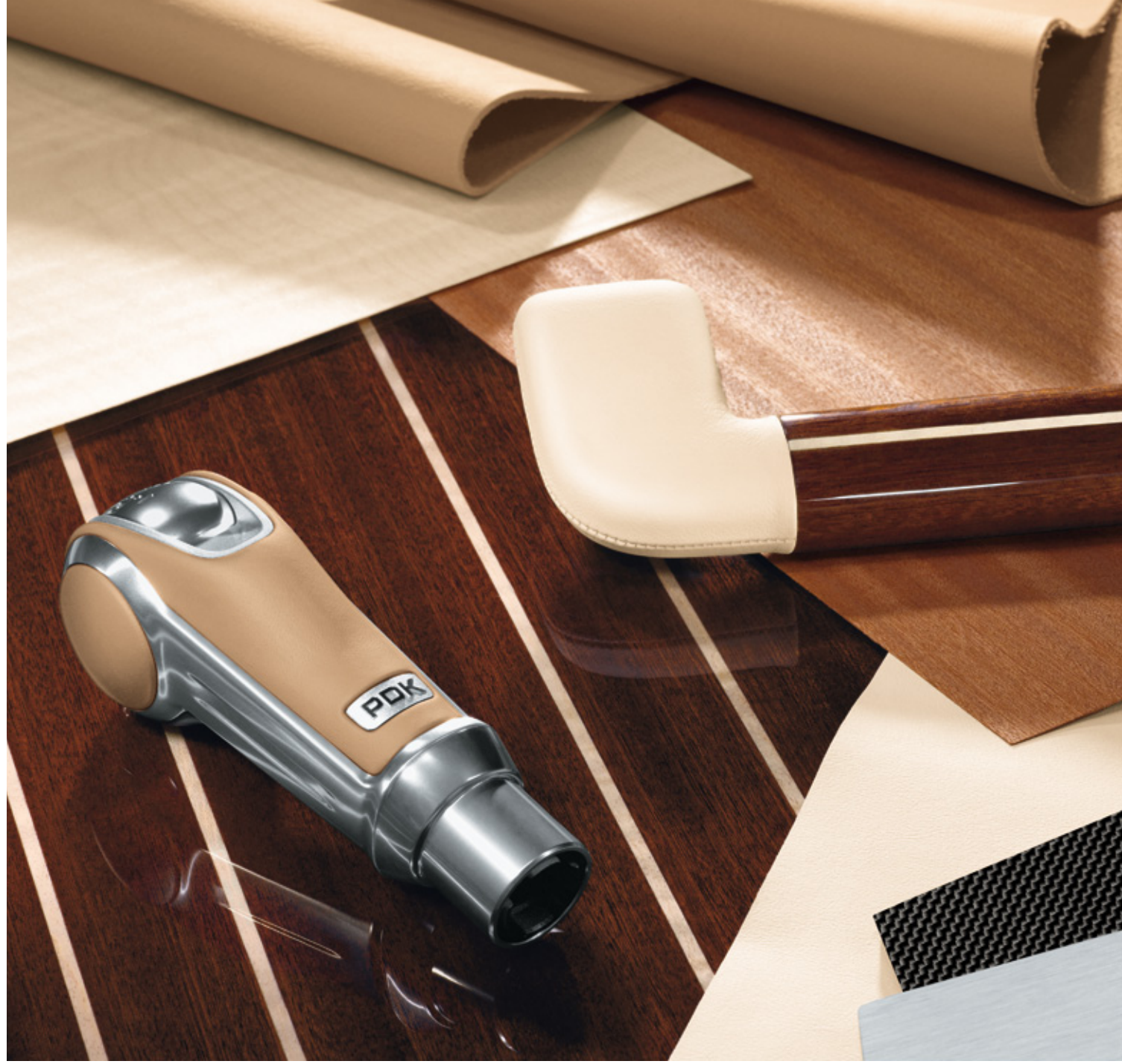
Material composition: Yachting Mahogany, leather, carbon and aluminium

So whether you would like to personalise the interior or exterior of your car, your wish is our command.