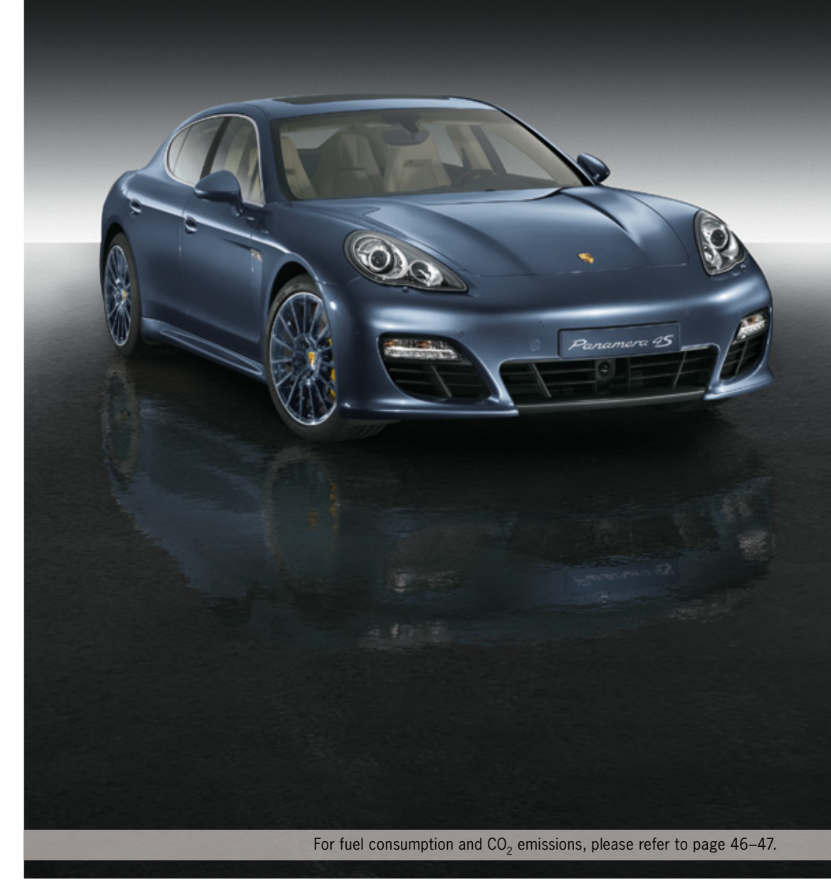
SportDesign package, headlight cleaning system covers painted, 20-inch Panamera Sport wheels painted