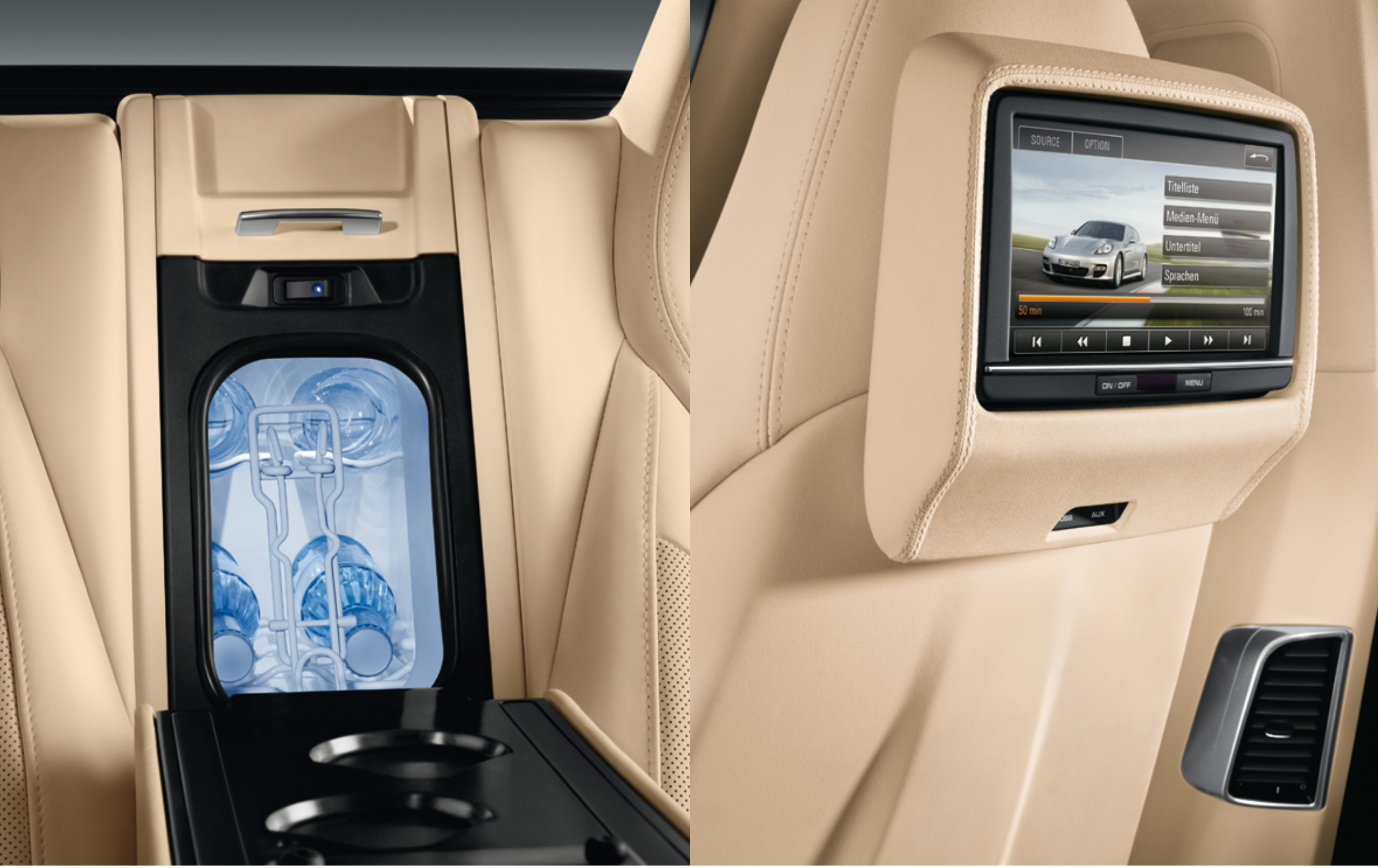
Cooling compartment in rear