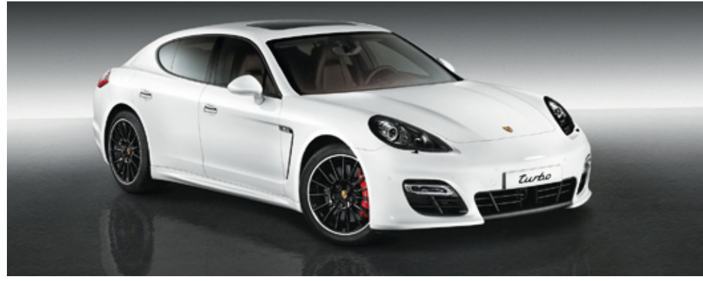
SportDesign package, 20-inch Panamera Sport wheels in black (high-gloss), Bi-Xenon headlights in black including PDLS, exterior mirror lower trims painted