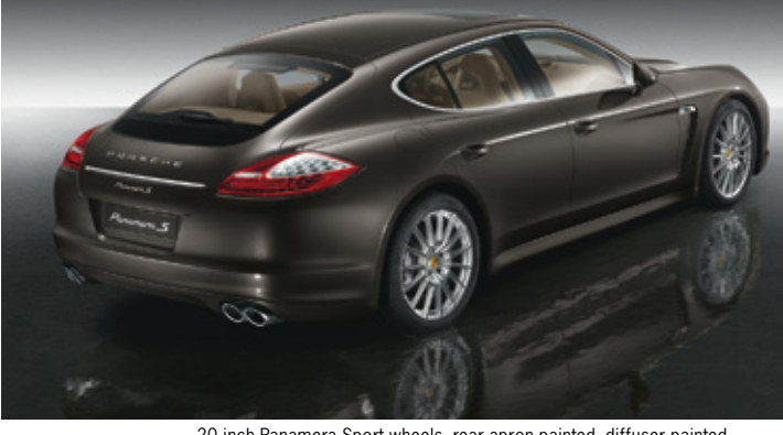
20-inch Panamera Sport wheels, rear apron painted, diffuser painted

Interior package painted, PCM surround painted, air vent slats painted, instrument dials in Luxor Beige, Sport Chrono stopwatch dial face in Luxor Beige, steering wheel column casing in leather