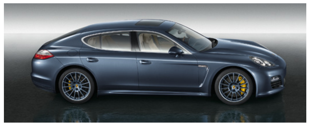
SportDesign package, 20-inch Panamera Sport wheels painted