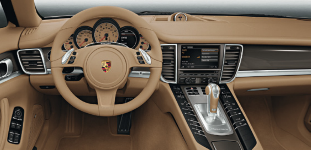
Interior package painted, air vent slats painted, PCM surround painted, instrument dials in Luxor Beige, Sport Chrono stopwatch instrument dial in Luxor Beige