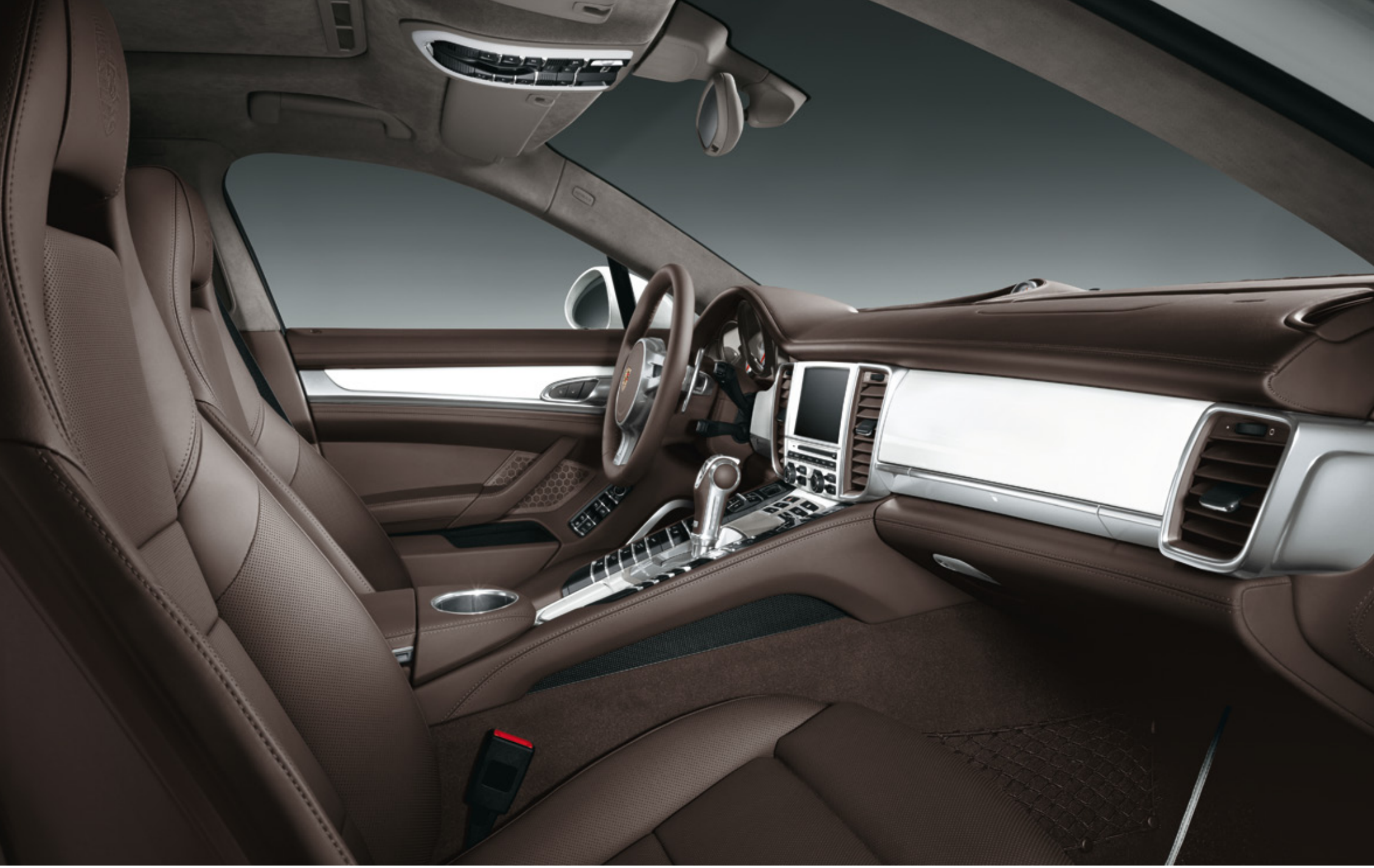
Interior package painted, PCM surround painted, dashboard trim package in leather, dashboard end trims in leather, air vent slats in leather, steering wheel column casing and instrument surround in leather, rear-view mirror in leather, Porsche Crest embossed on front headrests, rooflining grab handles in leather, PDK gear selector in aluminium