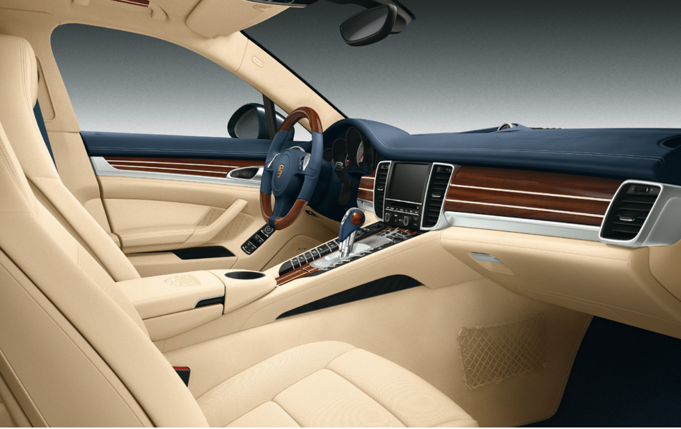
Yachting Mahogany interior package, heated multifunction steering wheel in Yachting Mahogany, grab handles in Yachting Mahogany, sun visors in leather, gear selector in Yachting Mahogany, front centre console armrest with Porsche Crest, personalised floor mats with leather edging