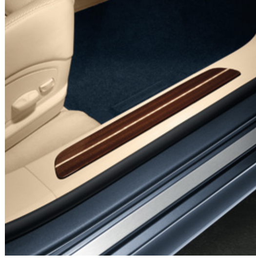
Door sill guards in Yachting Mahogany