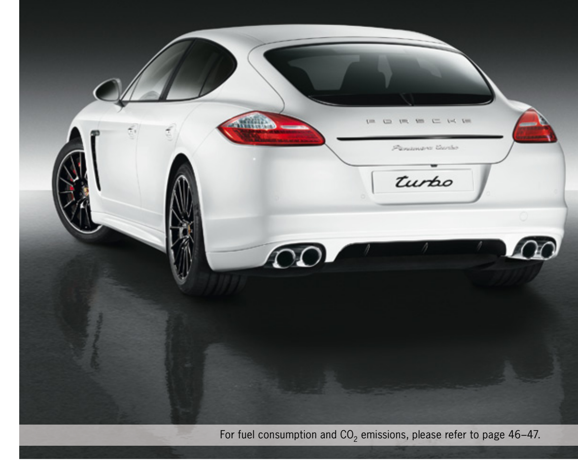
SportDesign package, sports tailpipes, 20-inch Panamera Sport wheels painted in black (high-gloss), Porsche logo and model designation painted