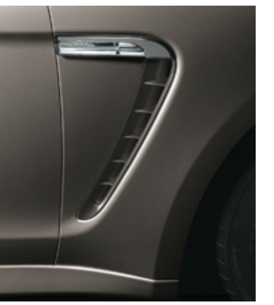
Air outlet grilles painted

finishing touches according to your personal request, right down to the Sport Chrono stopwatch dial face in Luxor Beige.