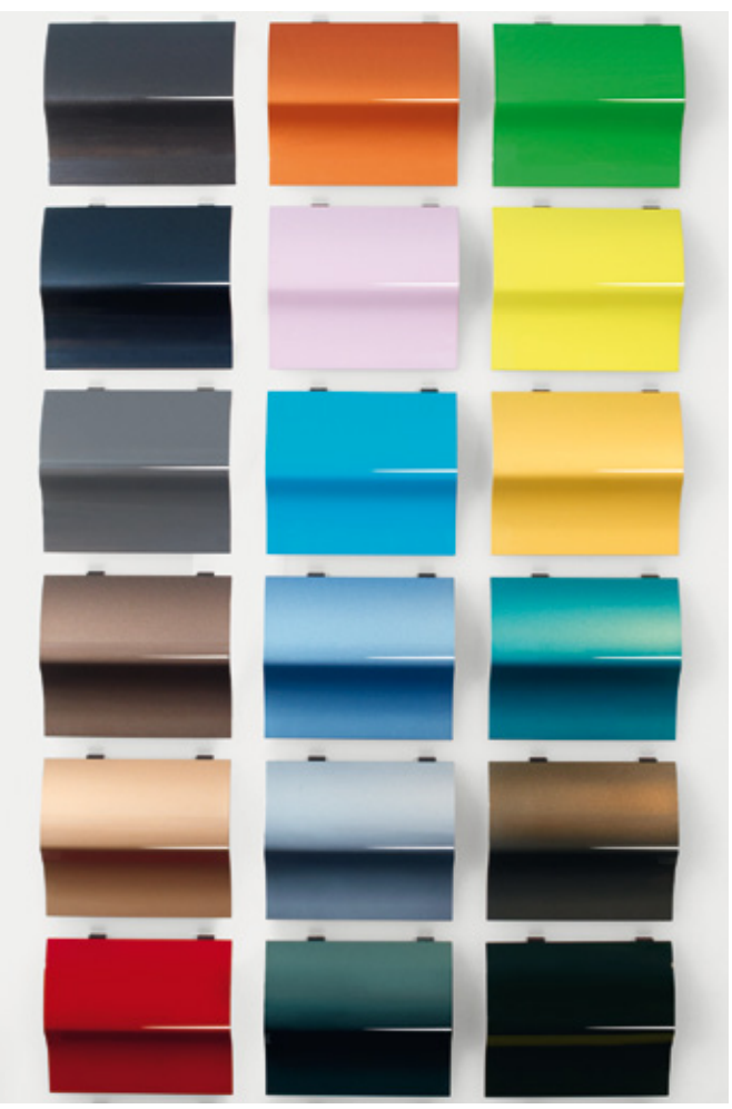
Paint in colour to sample: example colours to sample<sup>1)</sup>

We can offer a comprehensive selection of colours and materials for you to choose from when designing your new Porsche. A range of colours to sample is available for the exterior, while the interior can be refined with a selection of elegant woods and high-quality materials such as carbon, aluminium, Alcantara or elegant mahogany. You can find out what is possible at your Porsche Centre. Alternatively, you could visit one of our Customer Centres in Zuffenhausen or Leipzig, where we would be pleased to assist you directly and give you the exclusive advice you need (see page 40).