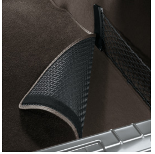
Personalised luggage space mat with leather edging