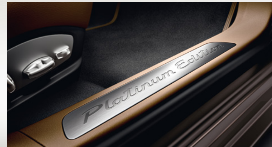
Door sill guard with 'Platinum Edition' logo