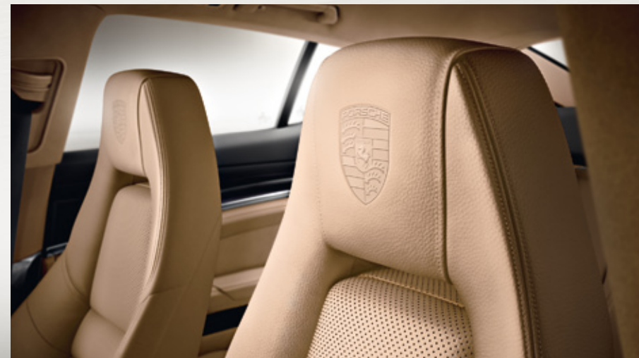
Headrest with Porsche Crest