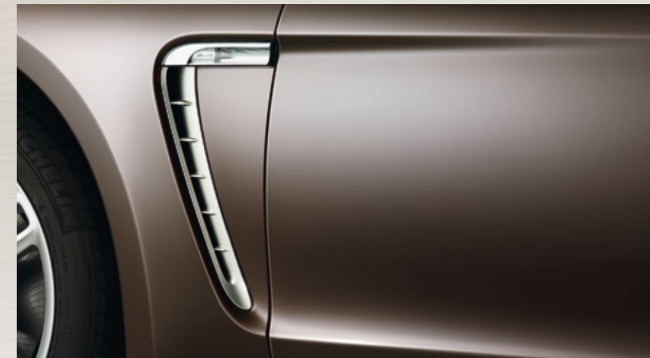
Side air outlets