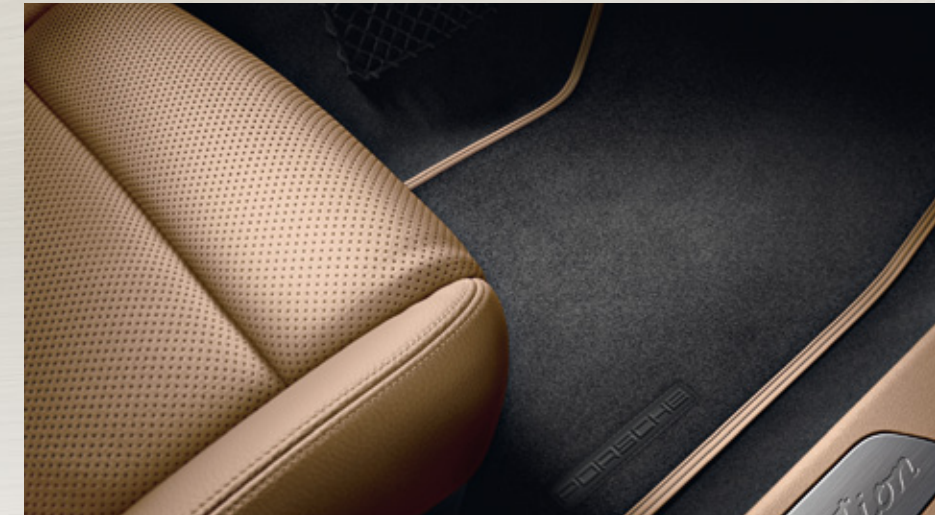
Floor mat in Panamera Platinum Look