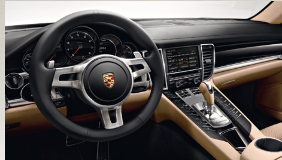
SportDesign steering wheel

In short, the standard specification exceeds your expectations of what a sports car has to offer.