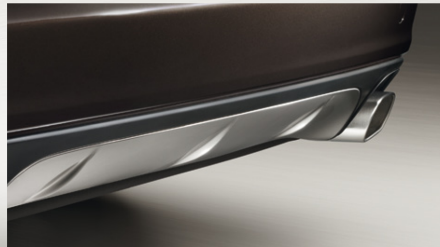
Finned rear diffuser