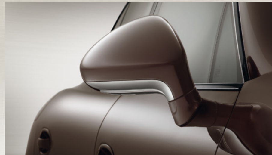
Exterior mirror lower trims

For details, please refer to the Panamera Platinum Edition price list or visit the Porsche Car Configurator at www.porsche.com .