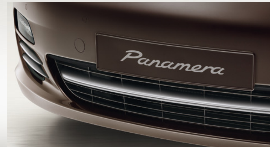
Slats in the front apron