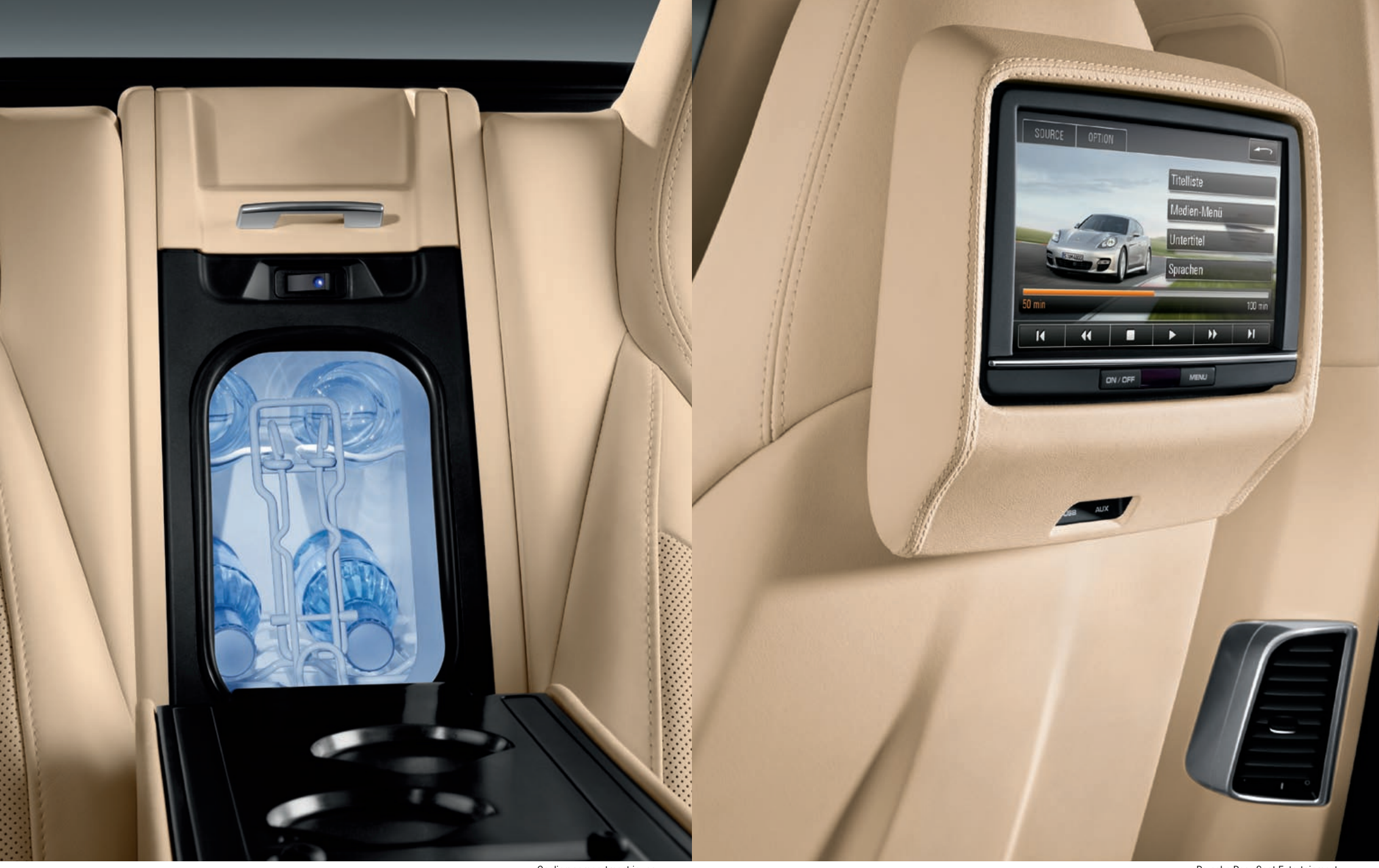
Porsche Rear Seat Entertainment Cooling compartment in rear