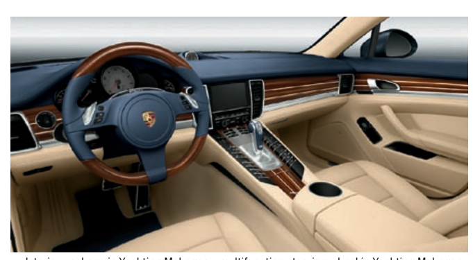
Interior package in Yachting Mahogany, multifunction steering wheel in Yachting Mahogany including steering wheel heating