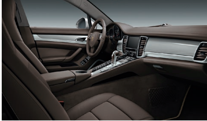
Interior package painted, PDK gear selector in aluminium, air vent slats in leather