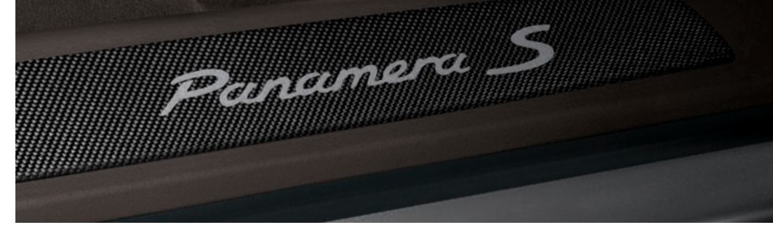
Door sill guards in carbon