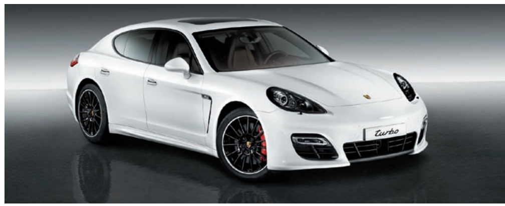
SportDesign package, 20-inch Panamera Sport wheels in a black high-gloss finish, Bi-Xenon headlights in black including PDLS, exterior mirror lower trims painted