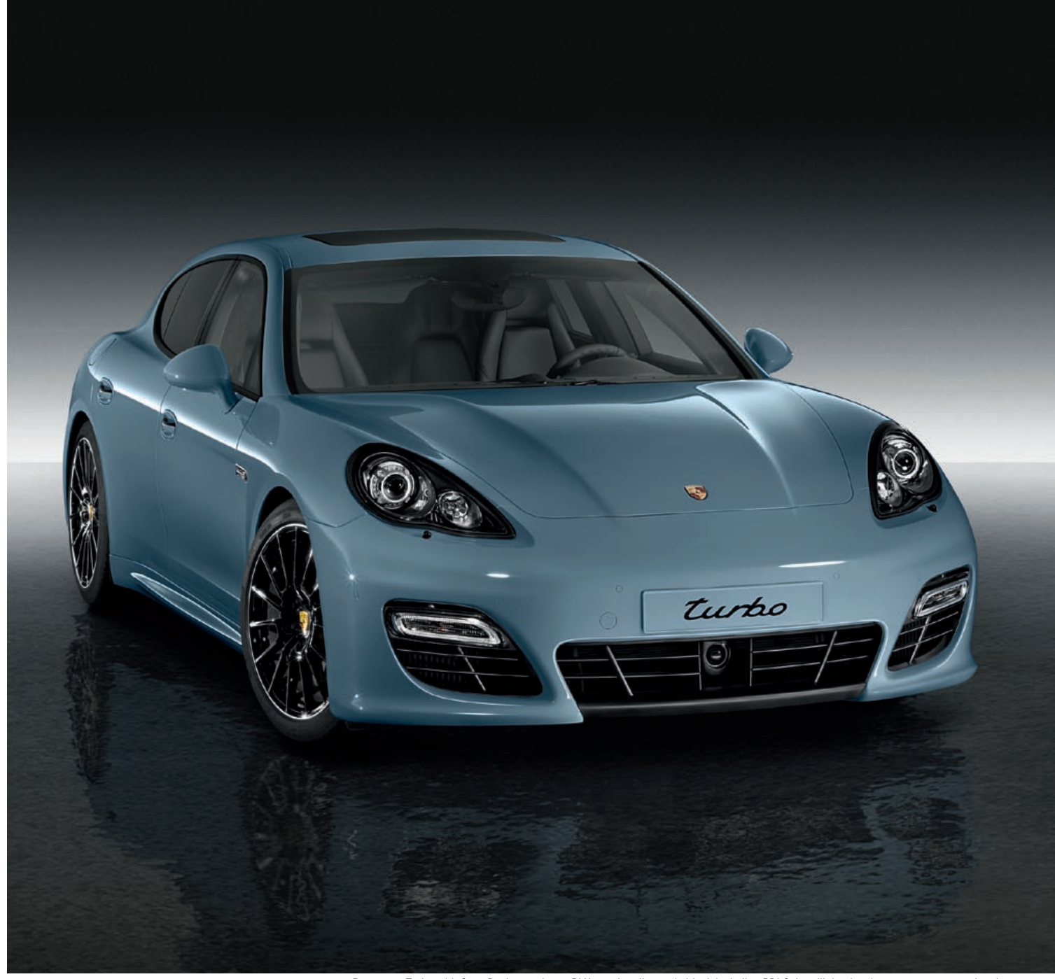
Panamera Turbo with SportDesign package, Bi-Xenon headlamps in black including PDLS, headlight cleaning system covers painted, 20-inch Panamera Sport wheels in a black high-gloss finish

Find out more about how to design your own special Porsche on page 44.