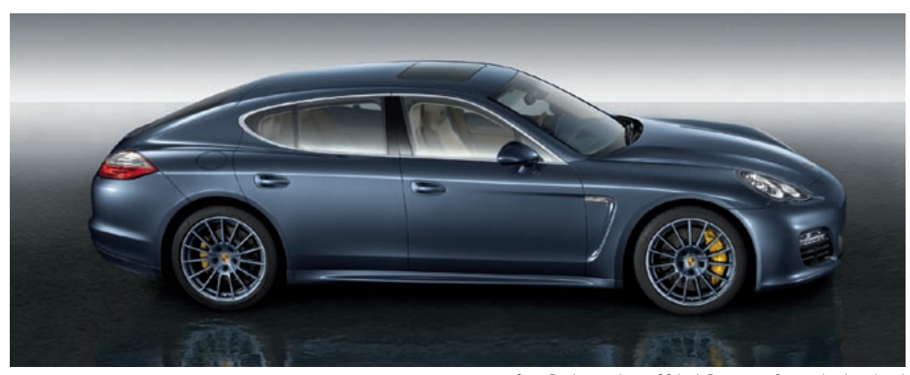
SportDesign package, 20-inch Panamera Sport wheels painted