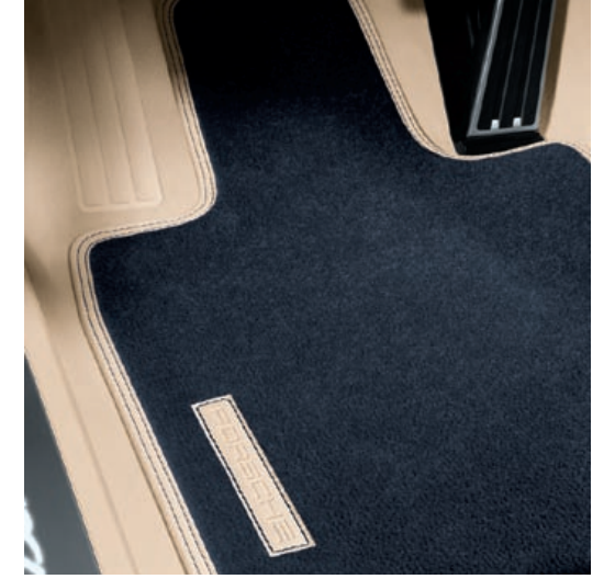
Personalised floor mats with leather edging