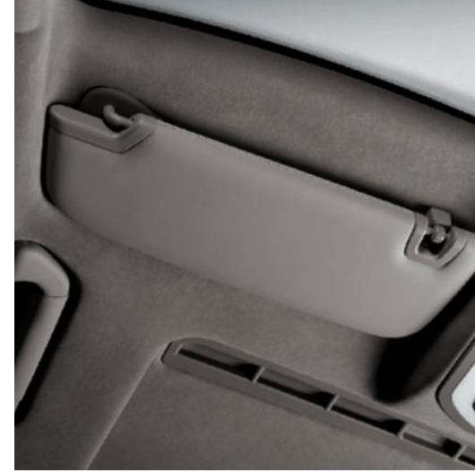
Sun visors in leather