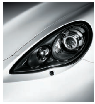
Bi-Xenon headlights in black including PDLS

Find out more about the equipment details of the Panamera Turbo in the current Panamera price list.