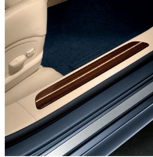
Door sill guards in Yachting Mahogany