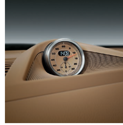
Sport Chrono stopwatch dial face in Luxor Beige