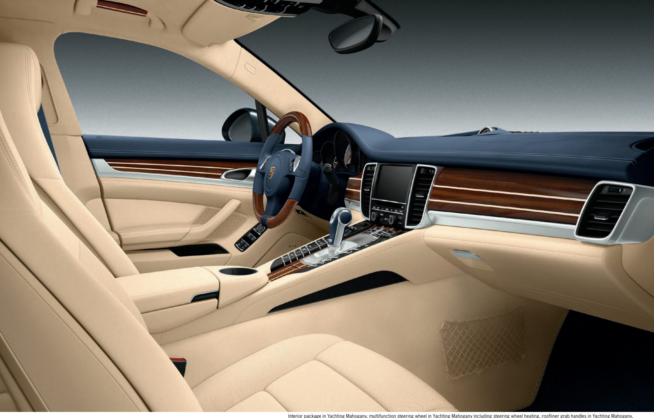
Interior package in Yachting Mahogany, multifunction steering wheel in Yachting Mahogany including steering wheel heating, roofliner grab handles in Yachting Mahogany, sun visors in leather, PDK gear selector in aluminium, personalised floor mats with leather edging