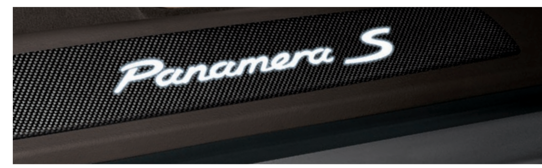
Door sill guards in carbon, illuminated