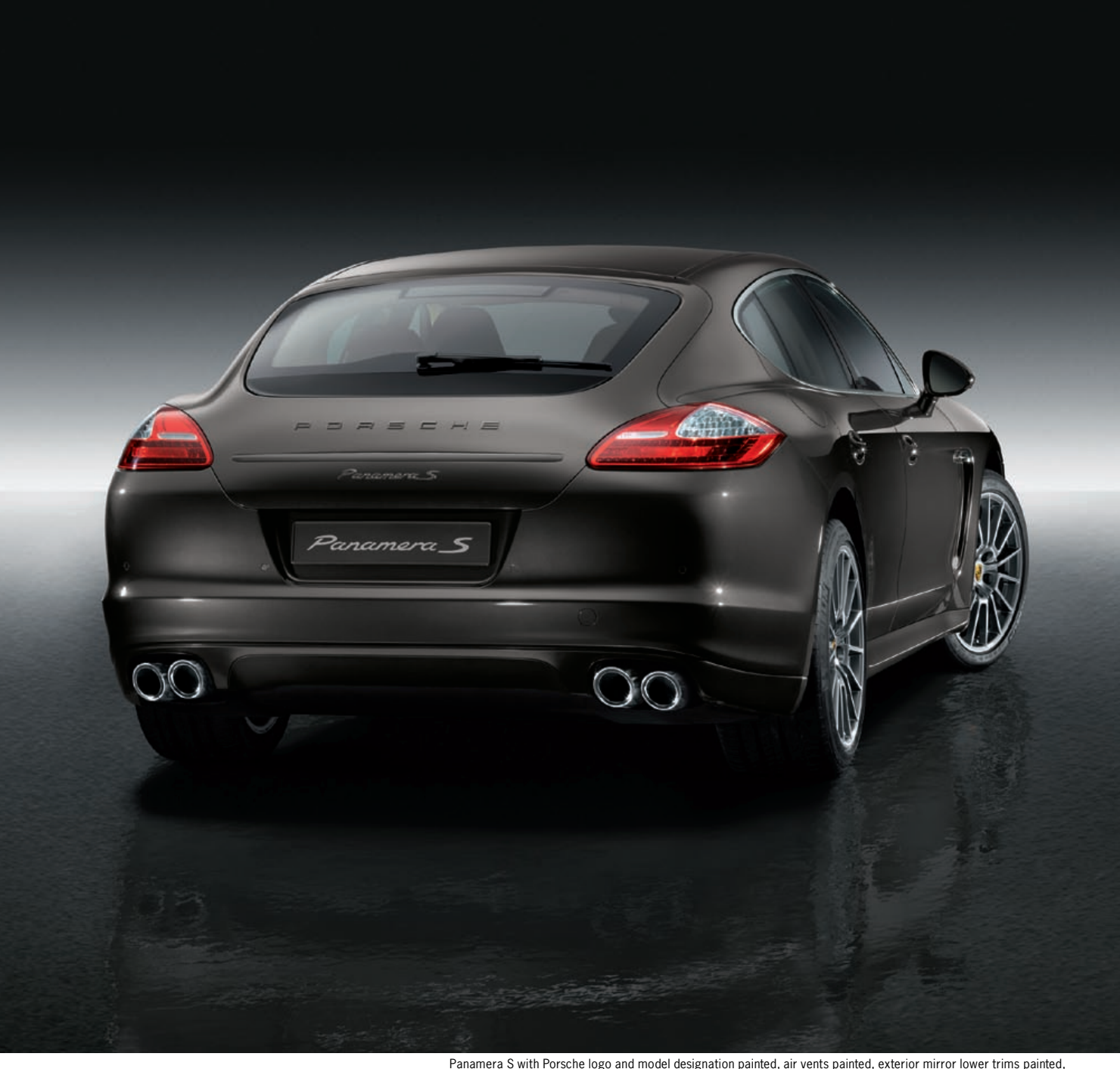
Panamera S with Porsche logo and model designation painted, air vents painted, exterior mirror lower trims painted, rear underbody apron painted, diffuser painted, sports tailpipes, 20-inch Panamera Sport wheels