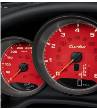
Instrument dials in Guards Red