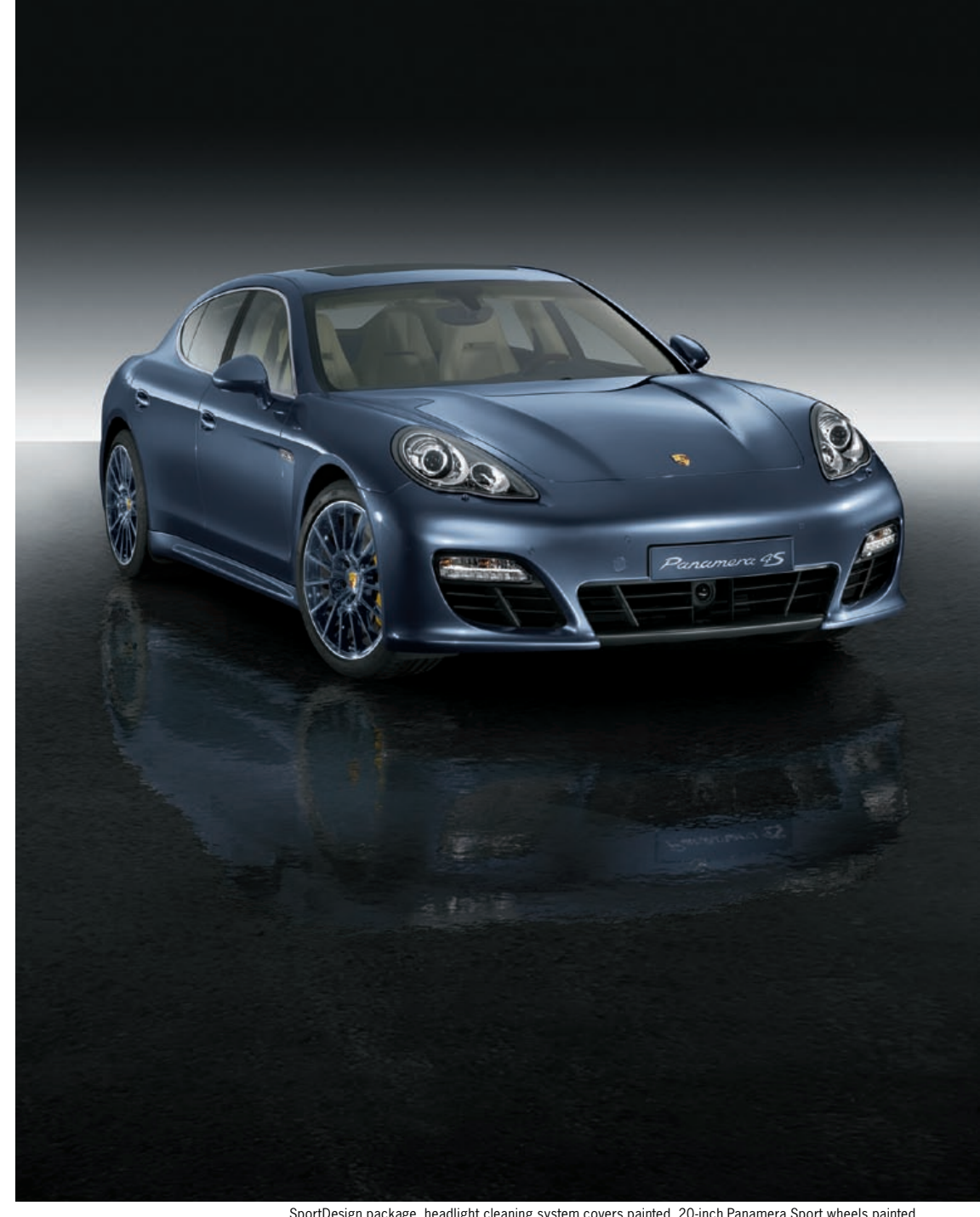
SportDesign package, headlight cleaning system covers painted, 20-inch Panamera Sport wheels painted