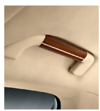
Roofliner grab handles in Yachting Mahogany

Find out more about the equipment details of the Panamera 4S in the current Panamera price list.