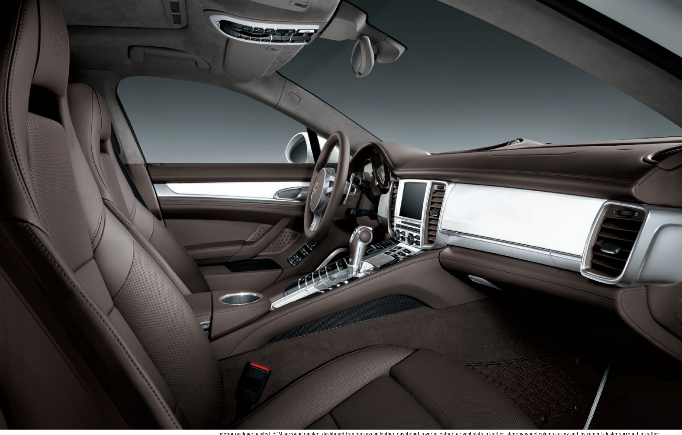
Interior package painted, PCM surround painted, dashboard trim package in leather, dashboard cover in leather, air vent slats in leather, steering wheel column casing and instrument cluster surround in leather, Porsche Crest embossed on front headrests, roofliner grab handles in leather, PDK gear selector in aluminium