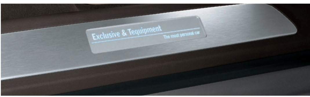
Personalised door sill guards in brushed aluminium, illuminated

38 | Exclusive options Exclusive options | 29