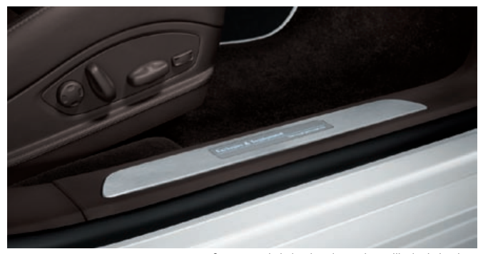
Seat console in leather, inner door sill trim in leather, personalised door sill guards in brushed aluminium, illuminated