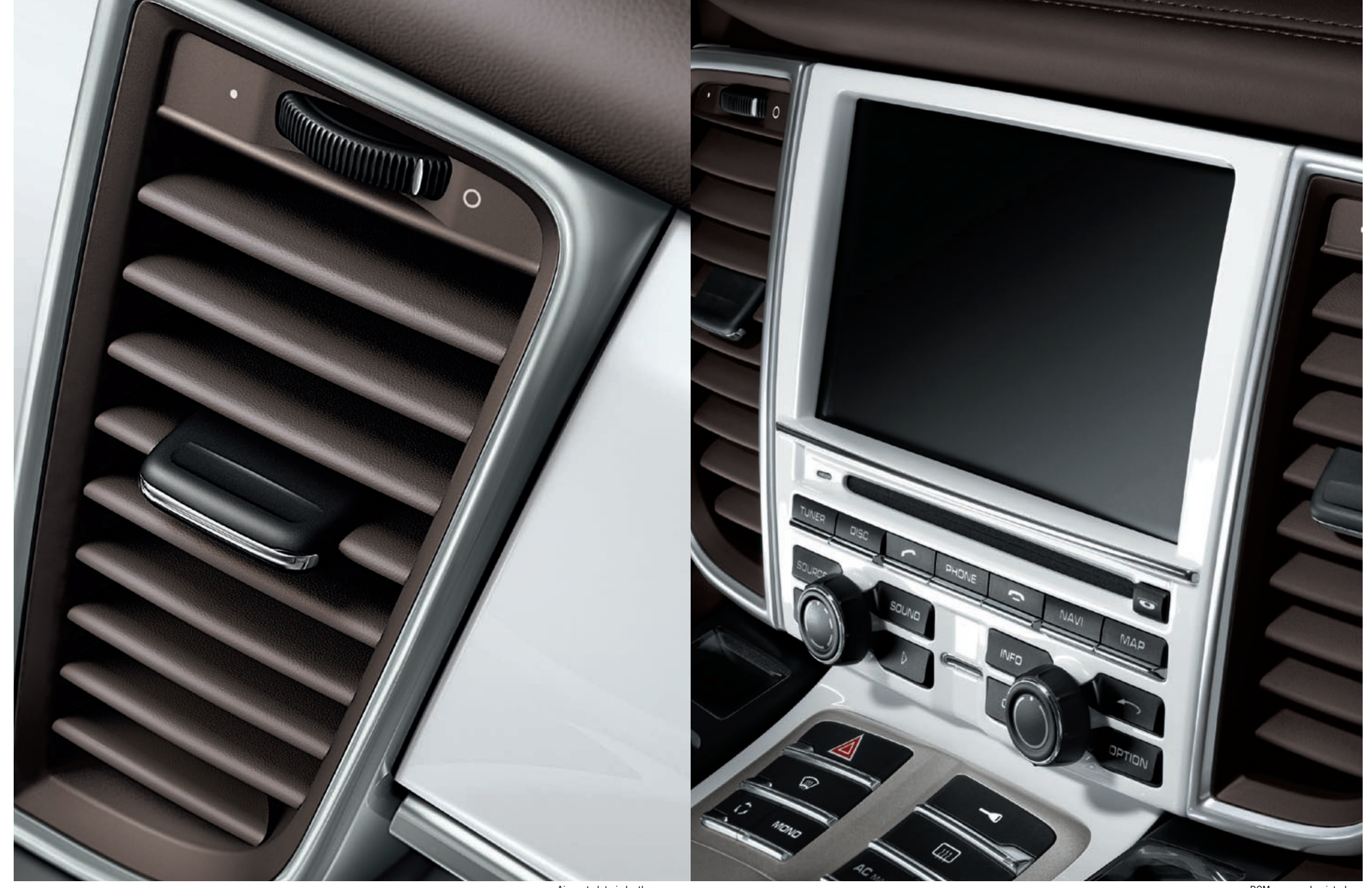
Air vent slats in leather PCM surround painted