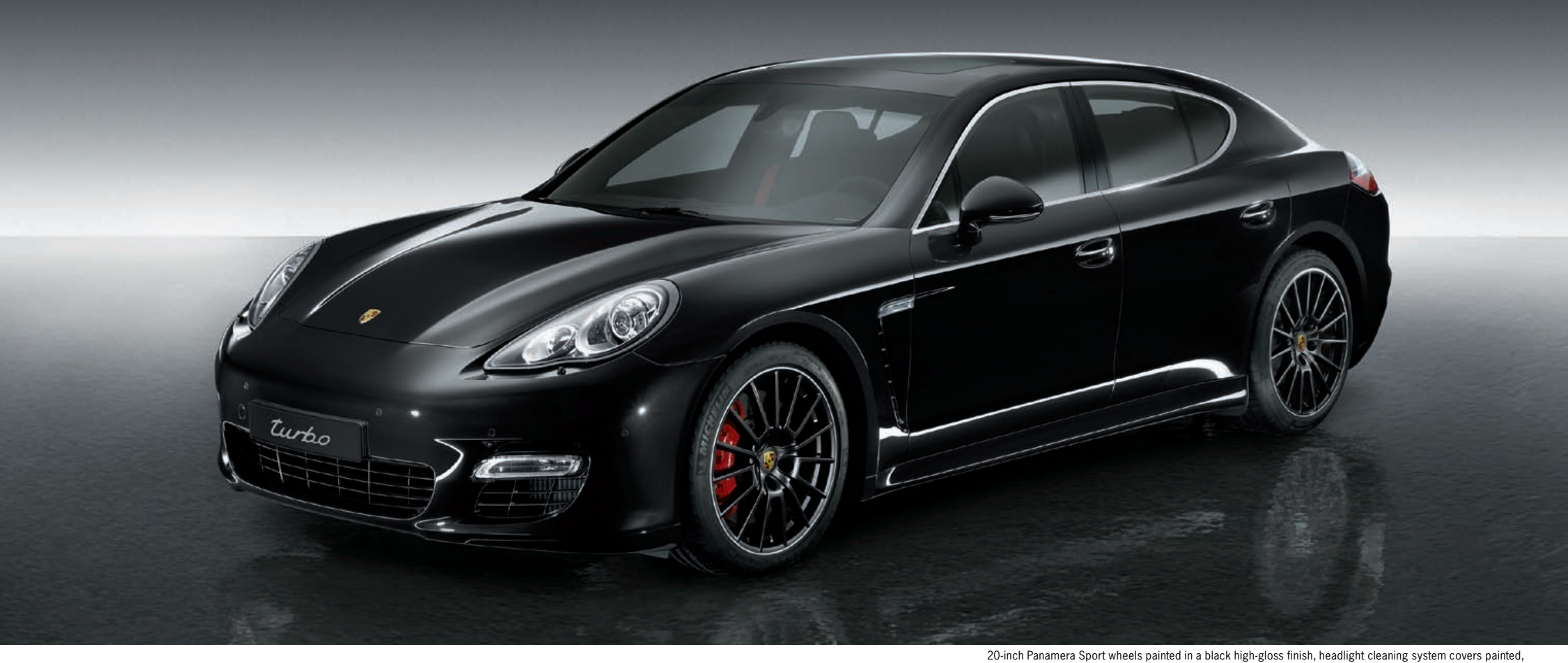
20-inch Panamera Sport wheels painted in a black high-gloss finish, headlight cleaning system covers painted, air intake grilles painted, air vents painted, exterior mirror lower trims painted

Offering room for four and plenty of room to be creative.