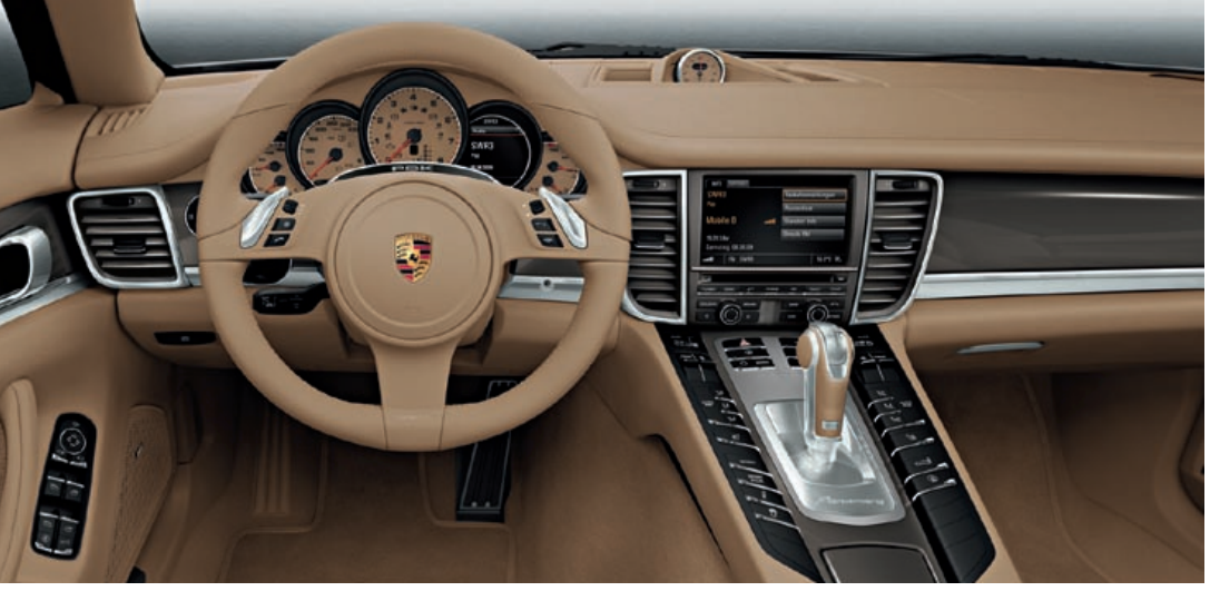
Interior package painted, air vent slats painted, PCM surround painted, instrument dials in Luxor Beige