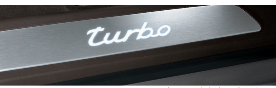
Door sill guards in brushed aluminium, illuminated