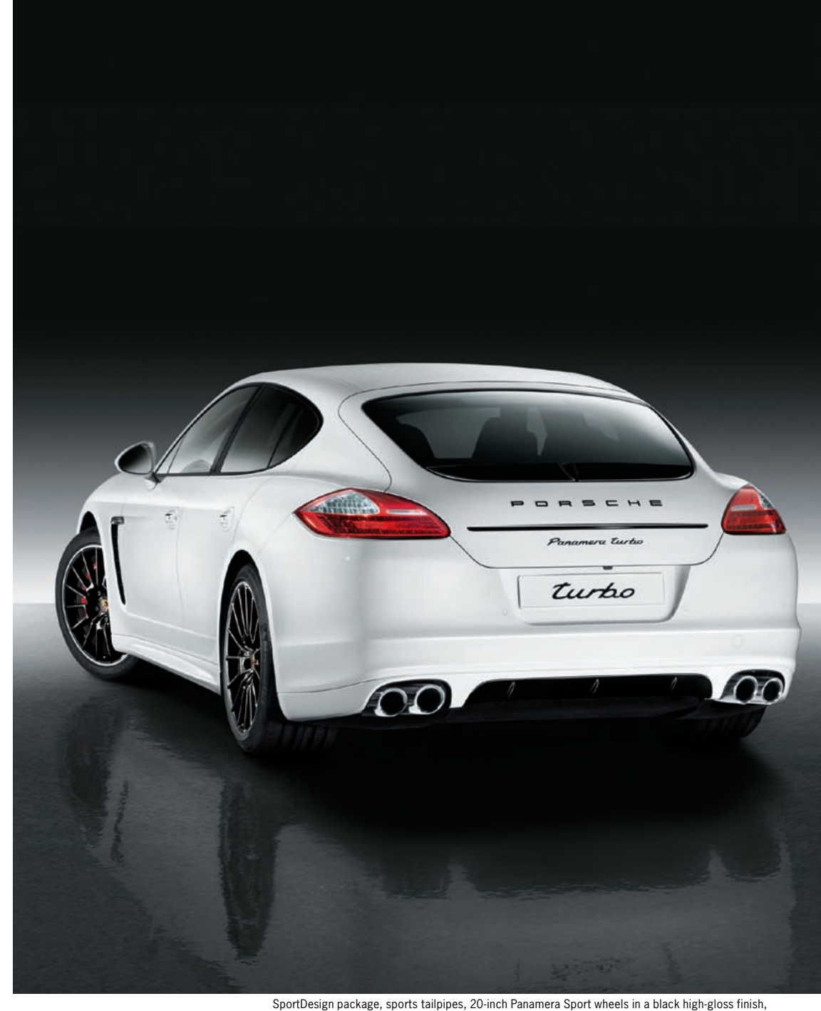
portDesign package, sports tailpipes, 20-inch Panamera Sport wheels in a black high-gloss finish, Porsche logo and model designation painted