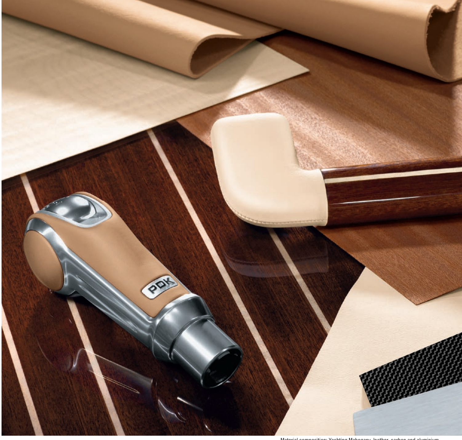
Material composition: Yachting Mahogany, leather, carbon and aluminium

So whether you would like to personalise the interior and exterior of your car, add a SportDesign package or Powerkit, your wish is our command.