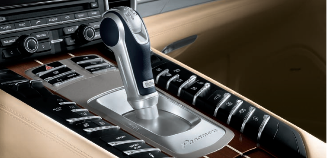
PDK gear selector in aluminium