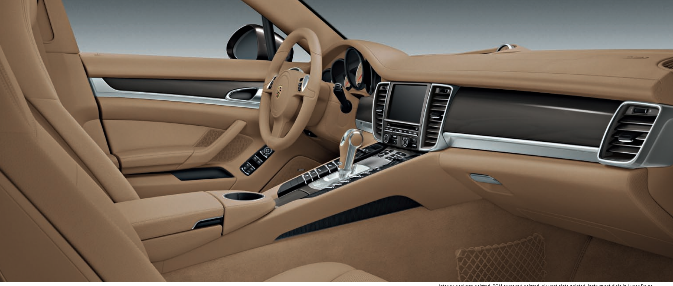
Interior package painted, PCM surround painted, air vent slats painted, instrument dials in Luxor Beige, Sport Chrono stopwatch dial face in Luxor Beige, steering wheel column casing in leather