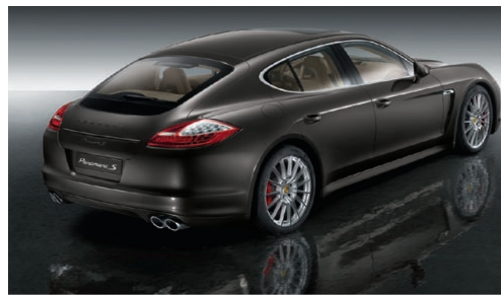
20-inch Panamera Sport wheels, rear underbody apron painted, diffuser painted