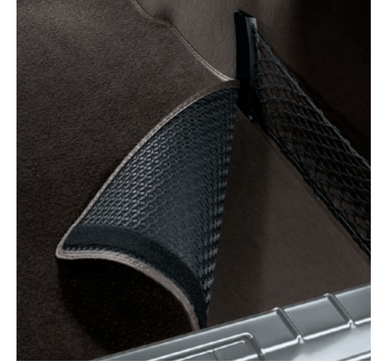
Personalised luggage space mat with leather edging