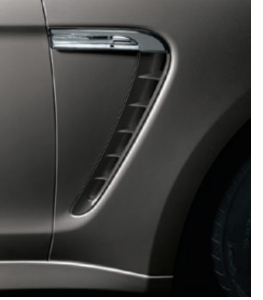
Air vents painted

Find out more about the equipment details of the Panamera S in the current Panamera price list.