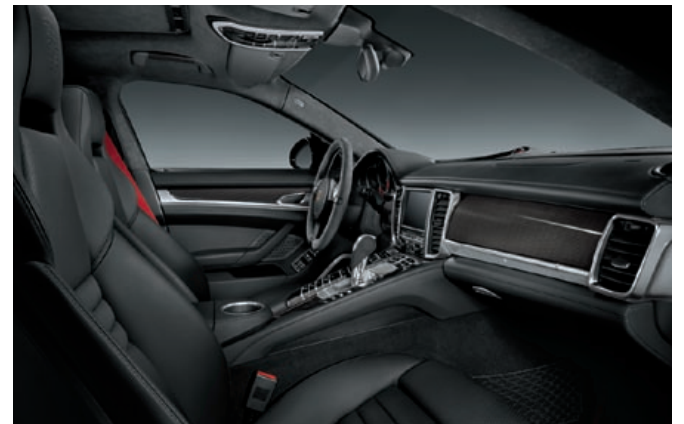
Dashboard trim package in leather, Sport Chrono stopwatch dial face in Guards Red, seat belts in Guards Red

Find out more about the equipment details of the Panamera Turbo in the current Panamera price list.