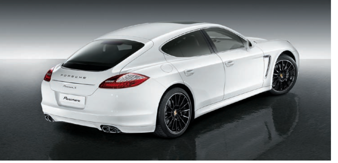
Air vents painted, rear underbody apron painted, diffuser painted, exterior mirror lower trims painted, 20-inch Panamera Sport wheels painted in a black high-gloss finish