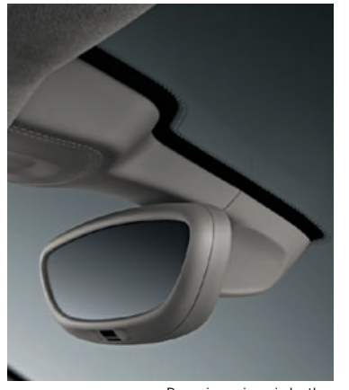
Rear-view mirror in leather

Find out more about the equipment details of the Panamera Turbo in the current Panamera price list.