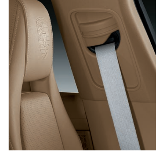
Porsche Crest embossed on front headrests, seat belts in Silver Grey