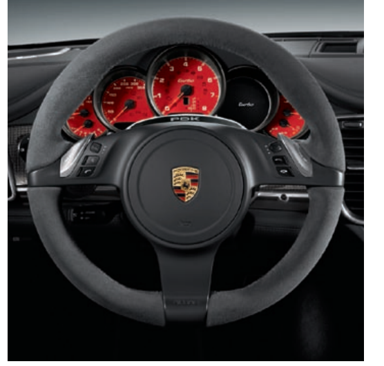
Alcantara steering wheel, padded