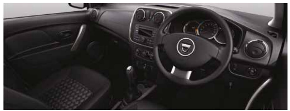
Dark carbon 'Quantum' cloth upholstery