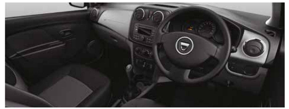
Two tone 'Atom' cloth upholstery