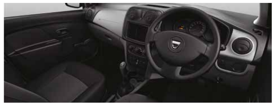
Black 'Element' cloth upholstery