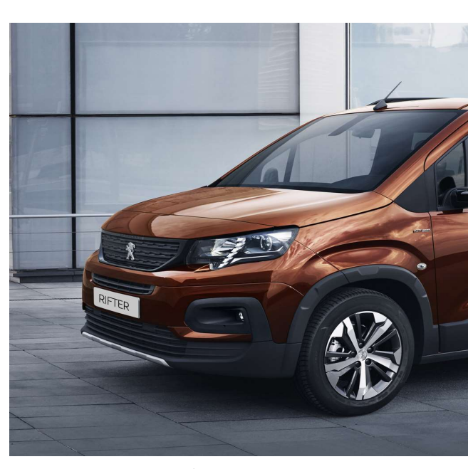
Model shown is PEUGEOT Rifter GT Line with optional Sunset Copper paint