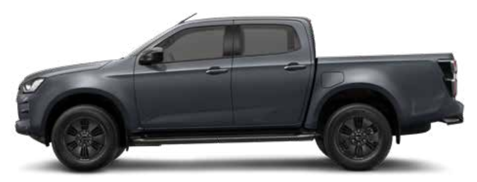
OBSIDIAN GREY MICA