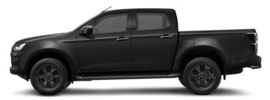
ONYX BLACK MICA