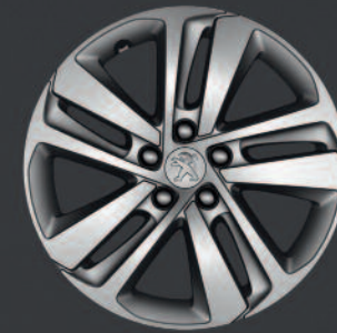
17 inch 'Phoenix' alloy wheels