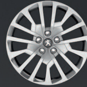
17 inch 'Miami' wheel trims