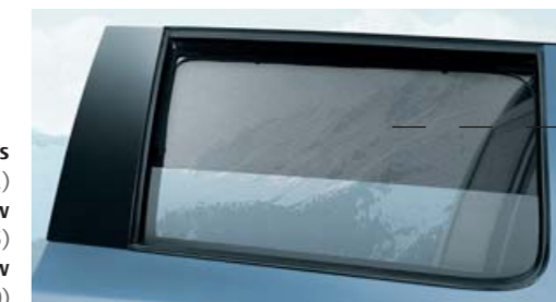
Rear side window sunblinds (5L0 064 361) No photo: Boot side window sunblinds (5L0 064 363) 5th door window sunblind (5L0 019 120)