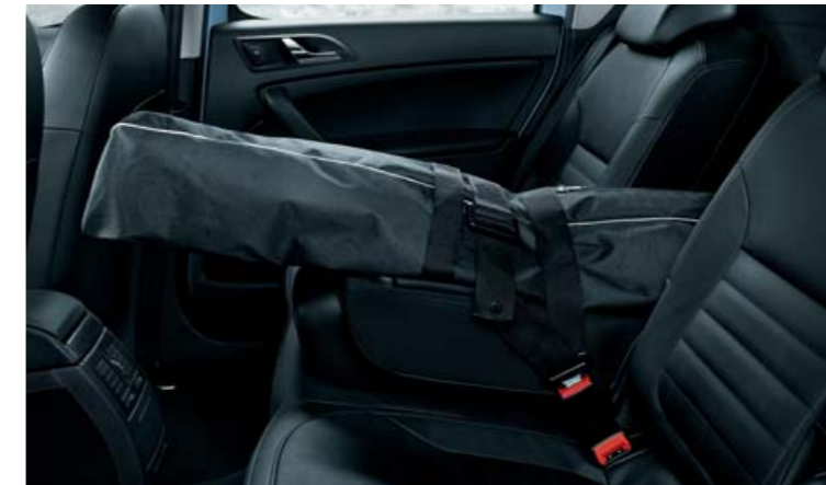
Ski sack for 2 pairs of skis (DMA 630 004)