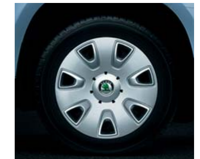
Hub cover Cold for wheel 6.0J x 16", 4-piece set (CDB 630 001)