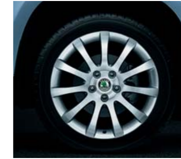
Alloy wheel 7.0J x 17" Annapurna for tyre 225/50 R17 (CCH 630 004)