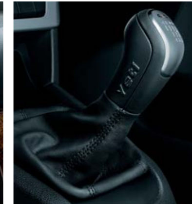
Leather gear stick knob with Yeti writing, 4x4 6-speed manual transmission (5L0 064 230A) no photo: 5-speed manual transmission (5L0 064 230); 6-speed manual transmission (5L0 064 230B) Leather gear stick sleeve (5L1 071 350)