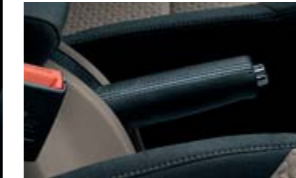
Leather handbrake lever for cars with Jumbo Box (FFA 600 011) no photo: for cars without Jumbo Box (FFA 600 010)