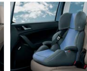
Wavo 1-2-3 child seat (5L0 019 900B)