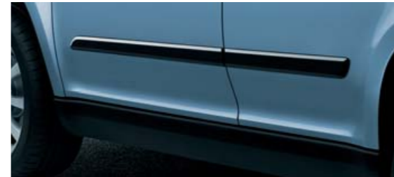
Decorative lateral strips with ALU insert (KGA 630 001)