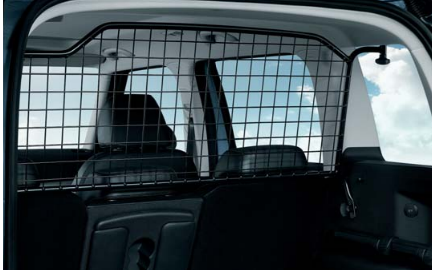
Trunk grille (DMM 630 001)