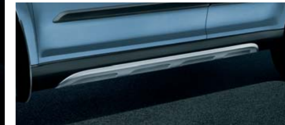
Side sill covers – ALU look (FAA 630 002)