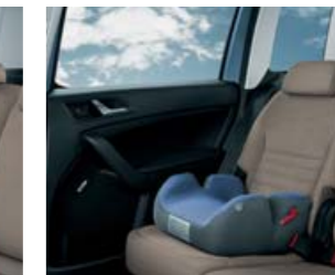
Wavo Kind child seat (5L0 019 900C)