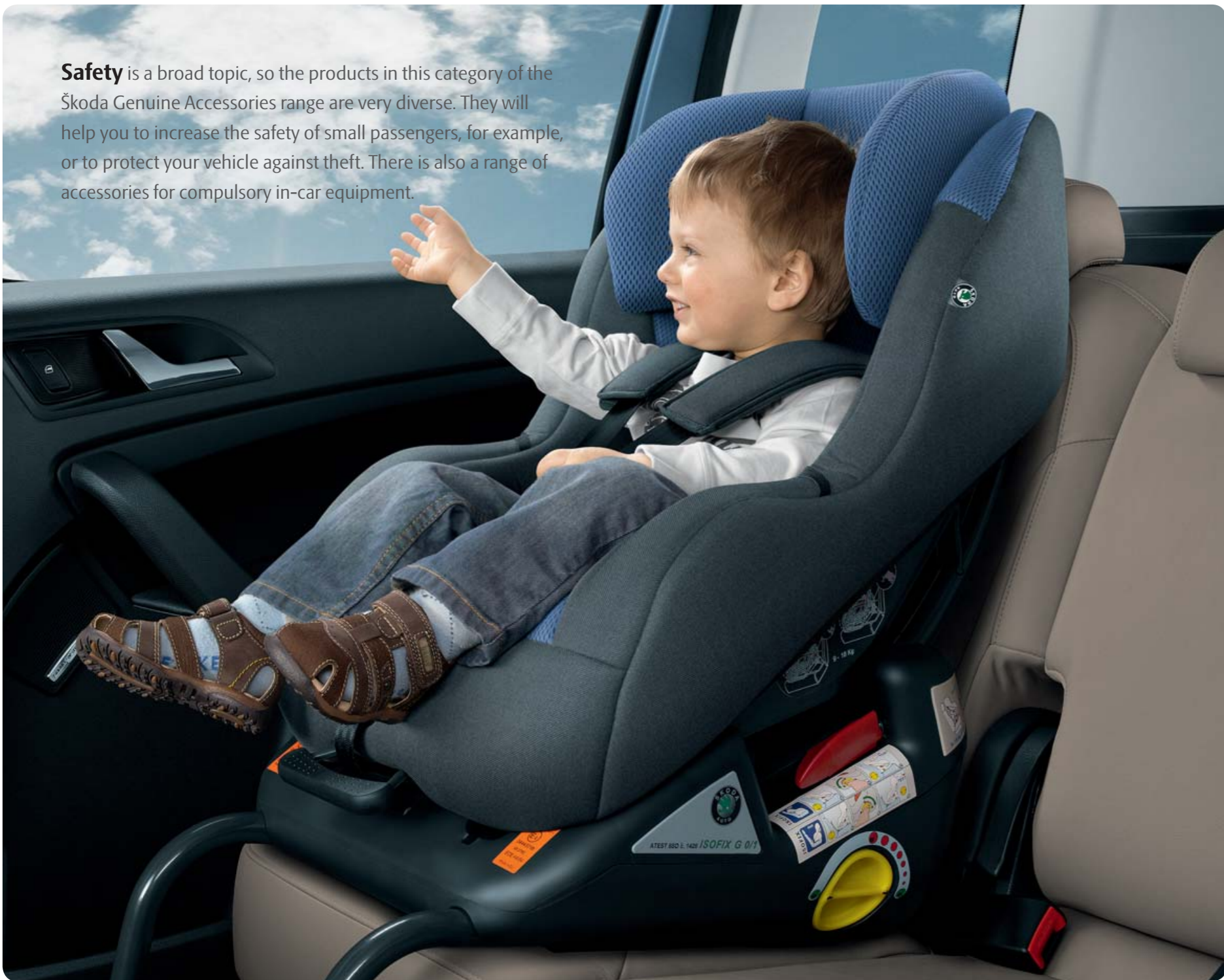
Baby One Plus child seat (5L0 019 900, 5L0 019 900A)

Safety is a broad topic, so the products in this category of the Škoda Genuine Accessories range are very diverse. They will help you to increase the safety of small passengers, for example, or to protect your vehicle against theft. There is also a range of accessories for compulsory in-car equipment.