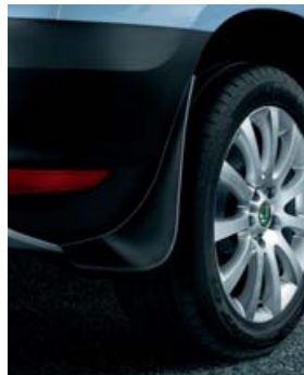
Rear mud flaps (KEA 630 002)