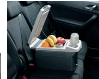
Car cooling box, 6-litre capacity (BCH 009 001)