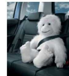
Cuddly Yeti toy (5L0 099 301)