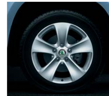
Alloy wheel 7.0J x 16" Moon for tyre 215/60 R16 (CCR 800 005)