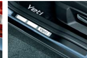
Decorative door sill covers with stainless steel inserts (KDA 630 002) No photo: Black door sill covers (KDA 630 001)*