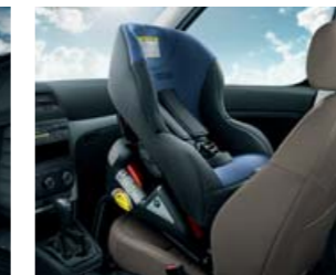
ISOFIX G 0/1 child seat (5L0 019 905, 5L0 019 905A-E) with RWF frame for rear-facing fitting (5L0 019 902A)