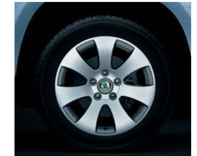
Alloy wheel 7.0J x 16" Spectrum for tyre 215/60 R16 (CCR 800 001)