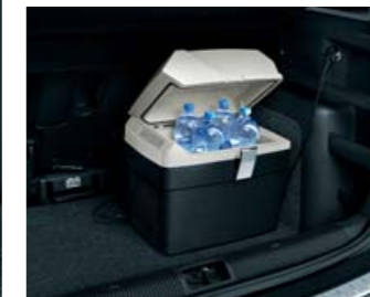
Car cooling box, 18-litre capacity (BCH 009 002)