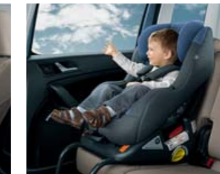
ISOFIX G 0/1 child seat (5L0 019 905, 5L0 019 905A-E) with FWF frame for forward-facing fitting (5L0 019 902) and headrest (5L0 019 903)