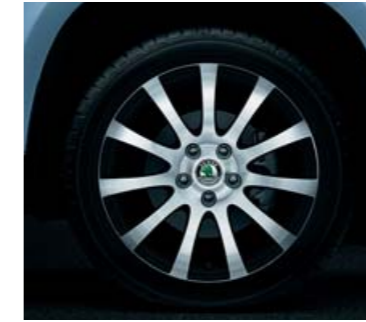
Alloy wheel 7.0J x 17" Annapurna – silver/black design to stress the off-road character, for tyre 225/50 R17 (CCH 630 005)