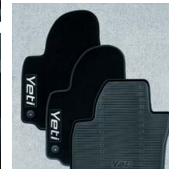
Foot mats, 4-piece sets (DCC 630 001 – rubber; DCA 630 001 – PA textile; DCA 630 002 – PP textile)