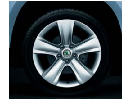
Alloy wheel 7.0J x 17" Dolomite for tyre 225/50 R17 (CCH 630 002)