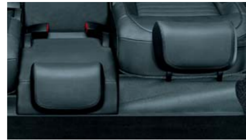
Boot cover behind rear seats to block the view of the luggage compartment (DMK 630 001)