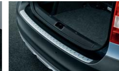
Decorative protective cover of the rear bumper – ALU look (5L0 071 360)