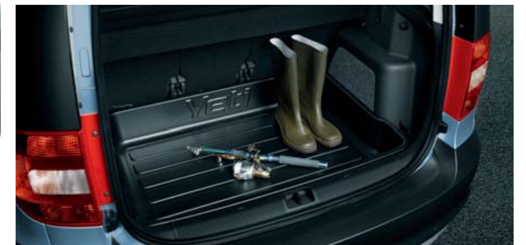
Textile boot mat for floor without spare wheel or false boot floor (DCD 630 001) No photo: Textile boot mat for floor with spare wheel or false boot floor (5L0 061 190)