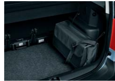
Boot bag (DMK 770 003)