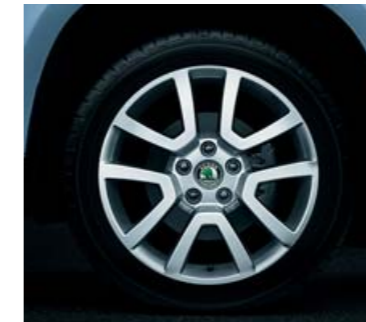
Alloy wheel 7.0J x 17" Spitzberg for tyre 225/50 R17 (CCH 630 003)