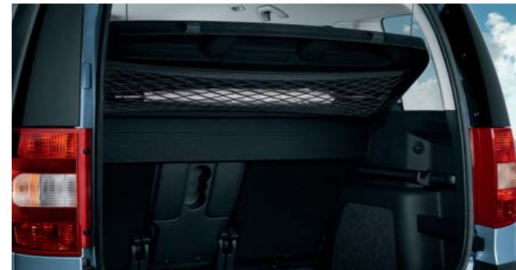
Netting system – silver colour design, 5-piece set (DMA 630 003 for floor without spare wheel; DMA 630 002 for false boot floor); 4-piece set (DMA 630 001 for floor with spare wheel)