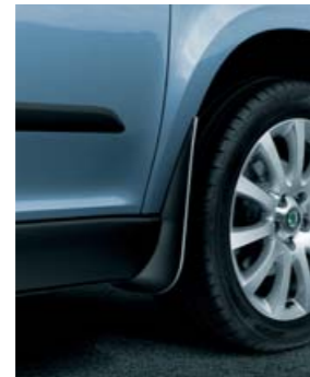
Front mud flaps (KEA 630 001)