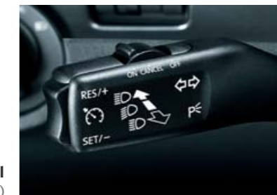
Cruise control (BEA 600 002A)