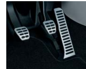
Stainless steel foot pedal covers, 3-piece set (5L1 064 200); 2-piece set for automatic transmission (5L1 064 205)