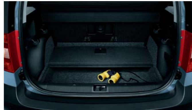
False boot floor (DAA 630 001)