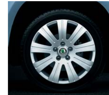
Alloy wheel 6.0J x 17" Flash for tyre 205/50 R17 (CCX 800 003) – suitable for snow chains (CEP 800 001)