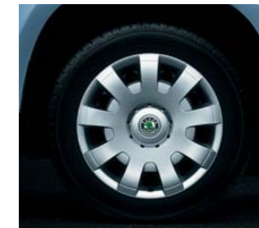
Hub cover Rif for wheel 7.0J x 16", 4-piece set (CDB 800 001)